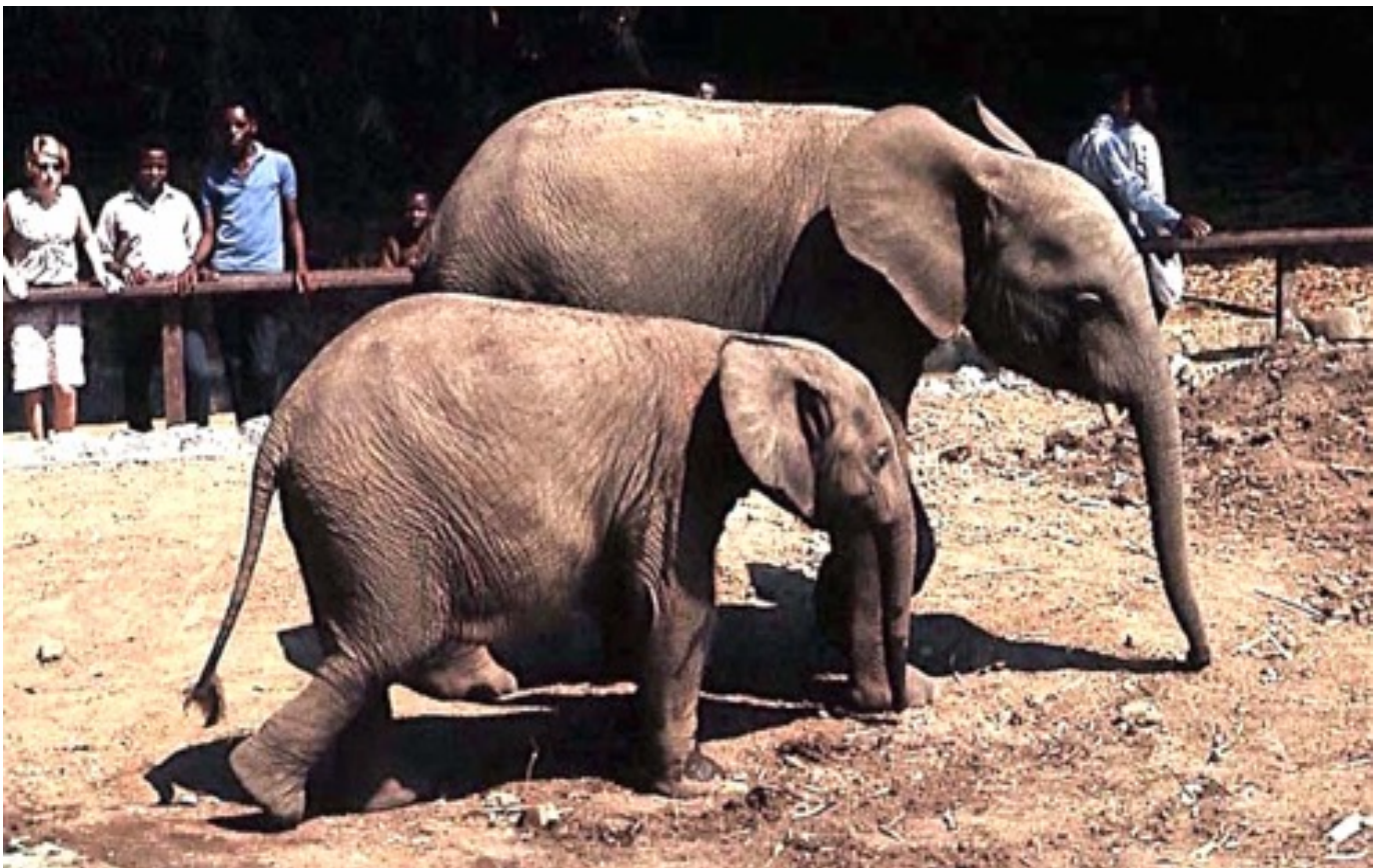
Young female African forest elephants ( Loxodonta cyclotis ) at the University of Ibadan Zoo. 1964.

One day, in October 1976, I found myself high in the skies above Africa's Sahara Desert. Nearly seven miles high in fact. Even from that height the particular patch of the earth's surface below me looked a little scary. It looked dry, remote and wild, with no sign of human activity. As I moved across it, the colours of the land varied, from rust red to golden brown with quite a few shades in between. Every now and then I could make out what seemed to