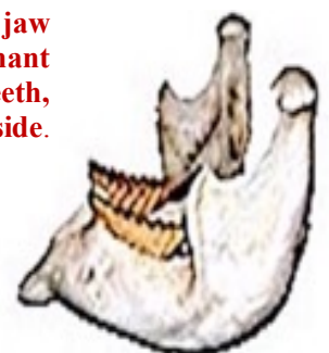
Drawing of the lower jaw bone of an African elephant showing two molar teeth, one on each side.