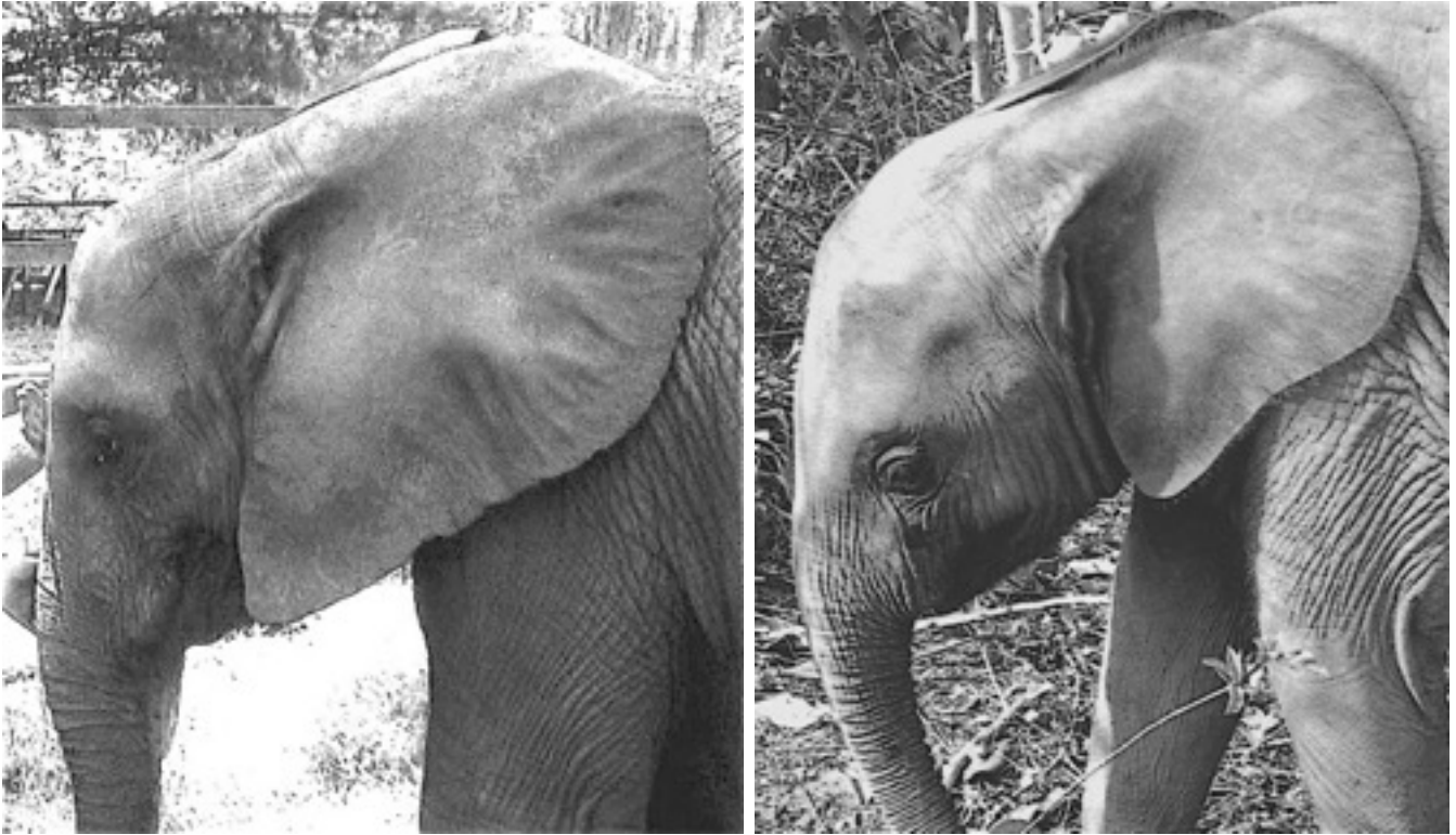
Left Loxodonta africana and right Loxodonta cyclotis . Both are young animals. Note that the lower external ear lobe or pinna of L. africana is more angular and extends further forward than that of L. cyclotis which has a generally smaller and more rounded pinna. The distance between the eye and the external auditory canal is proportionately greater in L. cyclotis which also has a longer and narrower mandible and a tendency to hold the head lower.

rose to to 158,000 and when I left my post in 1979 the figure was just under 250,000, more visitors than attended any other public attraction of any kind in Nigeria.