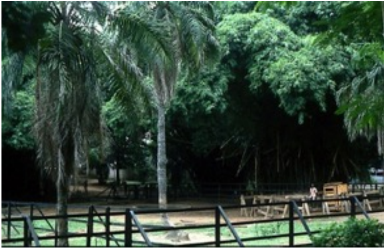
The elephant enclosure where Dora died. Note the enormous stand of bamboo that provided valuable shade (central dark area).

After another day during which Dora showed no sign of improvement, it was agreed that she should be examined as soon as possible while under general anaesthetic and arrangements were made for this to be done the following day.