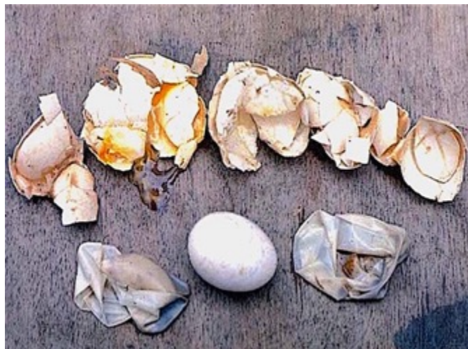
Bird (probably hens') eggs regurgitated by a black cobra (see photo page 4), apparently having been swallowed at different times and thus now at different stages of digestion.

couple of my zoo staff and armed with long, thick leather gloves and other venomous-snake-handling items, I drove to this man's compound. Unfortunately, however, a small gathering of young men had already spotted the snake and pelted it with stones until it was hit and dropped out of the bushes to the ground where it was immediately beaten to death. Interestingly, during the chase and before the snake was killed, it regurgitated a number of partly digested bird eggs - almost certainly domestic chickens' eggs - that it had consumed recently (see photo right).