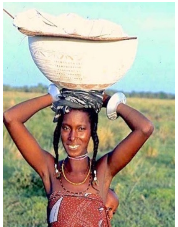
This bowl is the lower half of a calabash or gourd and is being used to carry milk. This Fulani woman was carrying not only the bowl of milk but also the small baby on her back. But she still made it look easy...

I began to pull out the plug of leaves to expose the contents. I did this slowly and with a degree of caution as I was aware that inside might be anything from a large spider or a bat to a baby crocodile or a green mamba. Holding the calabash at arm's length I stared hard into its dim interior; at first it was impossible to see anything at all but, after holding it at different angles and getting some light down