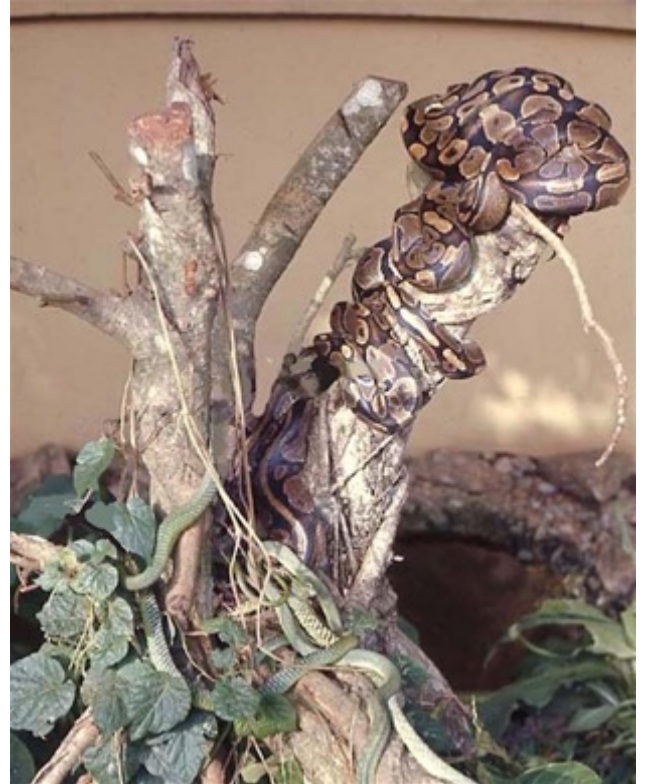
In the new snake enclosure. Royal pythons (on upper part of tree stump) were among the easier snakes for visitors to handle. They also remained exposed and on view for much of the time. 1965.

I can say that the snake enclosure was a success from the day it was opened. When the two reptile keepers had enough time, they entered the enclosure, singly or together, and talked to visitors about the snakes, some of which they allowed visitors to handle under their strict supervision. This always drew an enthusiastic response and, indeed, a whole new attitude to snakes evolved among our many regular zoo visitors, particularly among the younger Nigerians and parties of school children. Thus while the snake pit - as some called it - remained our only significant reptile exhibit for some time, it turned out to be a really valuable resource. On a point of information, we always took care to emphasise, and demonstrate, to visitors that some snakes are venomous and can kill, and that no snake should be handled until they were sure it was safe to do so.