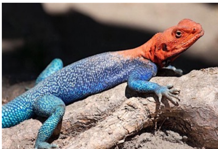
Male agama lizard ( Agama agama ).

Between 1963 and 1979 my work as Curator, then Director, of the Zoological Garden brought me into close contact with a wide range of West African animals, from gorillas to pangolins and from hornbills to cobras. I have already written a number of short stories about my experiences with some of these creatures. This just to remind the reader that this story - 'At the Beginning Were Two Chameleons' - focuses on reptiles and how I was eventually able to construct a multi-species reptile house that became one of the most popular attractions in the Zoo.