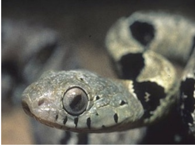
Young Blanding's tree snake ( Toxicodryas blandingii ).

a small snake, around 50cm (20in) long, lying there on the ground. I recognised it as a young Blanding's tree snake ( Toxicodryas blandingii ). This species is venomous but its bite is not regarded as dangerously toxic to man. It is a back-fanged species, so called because its fangs are grooved rather than hollow and are at the back, rather than the front, of the upper jaw. Thus a back-fanged venomous snake normally has to bite a victim with its back teeth before any venom is injected.