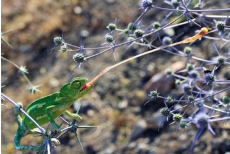
Chameleon feeding. The tongue is fully extended here, although the food item is not clear in this photo. The club-shaped end of the tongue is sticky and also partly wraps around the prey.