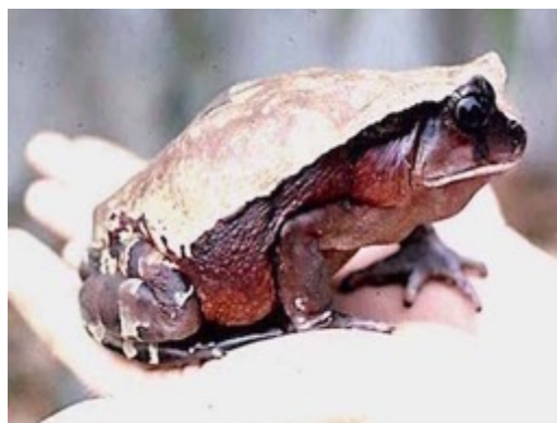
Immature African giant toad ( Sclerophrys superciliaris ?)