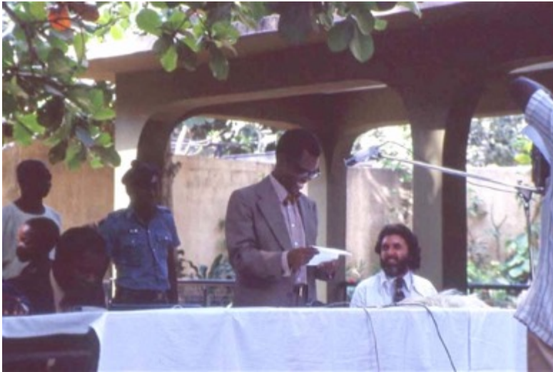
The Reptile House opening ceremony January 1978. On my right, in centre of picture, is the Vice-Chancellor of the University of Ibadan making the main speech.