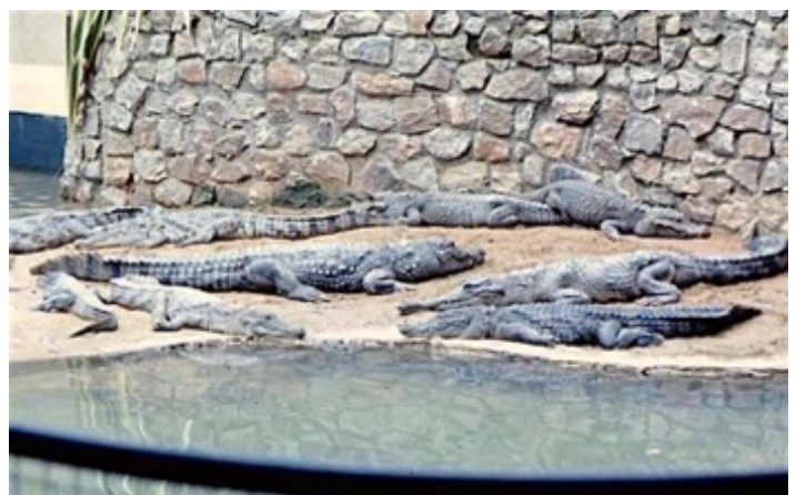
A closer look inside the crocodile enclosure. Three species can be seen here.

In 1977, a year or so after completion of the building, the University's Vice-Chancellor suggested there should be an official opening of the Reptile House. Thus an opening ceremony was organised for the 30 th of January, 1978, and duly took place in an area just in front of the new crocodile enclosure. The Vice-Chancellor led the ceremony and made a charming and encouraging speech in which he said how much the University valued the new Reptile House and indeed the Zoological Garden. Among others