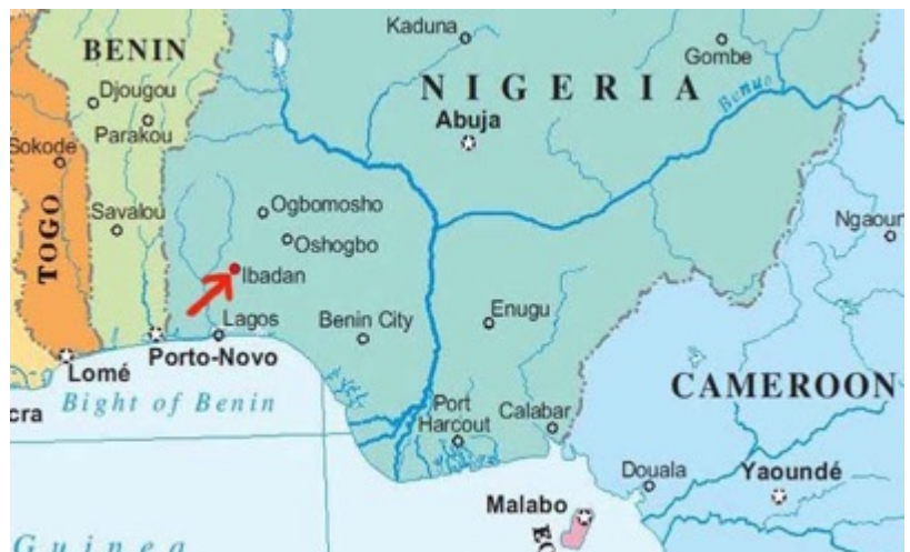
Nigeria, West Africa, showing Ibadan with its University and Zoological Garden.

I had already spent six months in what was then the British Cameroons, the country immediately to the east of Nigeria. I had accompanied Gerald Durrell, the animal collector and writer, on an animal collecting trip there, a trip later described by Durrell in his book 'A Zoo in my Luggage'. I had found the - often little known - wildlife of that part of West Africa fascinating and was thus intrigued by what seemed to be a most unusual opportunity. I decided to apply for the post. Just two or three weeks later I was invited to London where I was interviewed by a panel that included staff from the University of Ibadan in Nigeria as well as some of their London-based colleagues. The following week I was delighted to receive a telegram offering me the post.