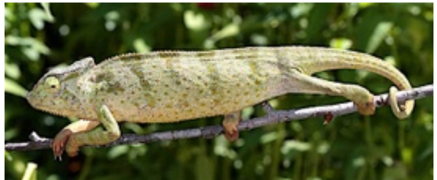
Chameleon using its prehensile tail to grasp a twig for greater stability and as it moves around among the branches.

Chameleons are popularly known for their ability to change their skin colour, skin markings or colour patterns. The colour changes are brought about by complex changes in the outer layers of the skin. A colour change may make the chameleon more difficult to see in a particular location or environment (ie., camouflage it), or it can affect heat absorption and thermoregulation, or it can be a response to a stress; it can even be used to send signals to other chameleons. The range and variety of the skin colours and markings is impressive (see photos page 8).