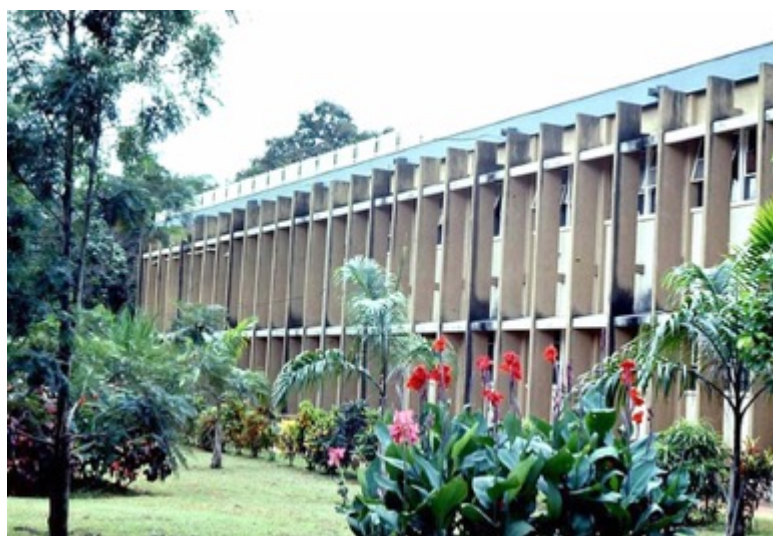
Queen Elizabeth Hall on the University of Ibadan campus. This was the main women's Hall of Residence, 1977.

The Nigerian staff, from senior academic and administrative staff to junior staff such as drivers and cleaners, consisted largely of men and women from across southern Nigeria - from Calabar to Enugu, from Benin City to Ibadan itself as well as a smaller number from further north. Thus several different indigenous languages were spoken among the Nigerian staff. The indigenous language of Ibadan and the south west area of Nigeria was Yoruba but standard English - Nigeria's official language - was spoken by educated Nigerians, including the University's academic and senior staff and students. However,