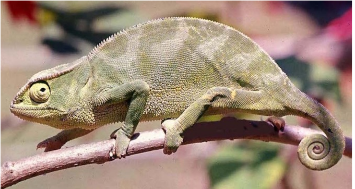
The first graceful chameleon ( Chamaeleo gracilis ) brought to the Zoo after my arrival.

inside, I could just make out a chameleon there at the bottom. How wonderful! The first chameleon I had seen in Nigeria. As I was unable to squeeze my hand through the narrow neck of the calabash, I pushed a long, slender stick inside and very gently pushed the little reptile's head on one side and then on the other. Then, just as I had hoped, it suddenly grabbed the stick in one, then both, front feet and I was able to pull it carefully up and out of its dark little world.