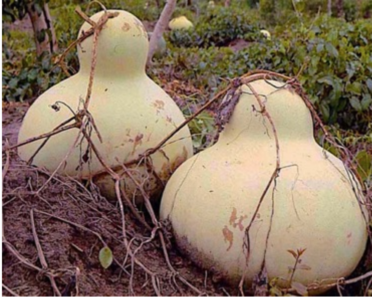
These two calabashes were growing on a farm in Oyo, south western Nigeria. They are almost at the stage when they are cut from the parent plant prior to being prepared as containers.

I should explain that an African calabash is a dried, hard-walled fruit that has had its contents removed so that it can be used as a container. Calabashes can be of different sizes and shapes and are produced by more than one species of plant; they are used