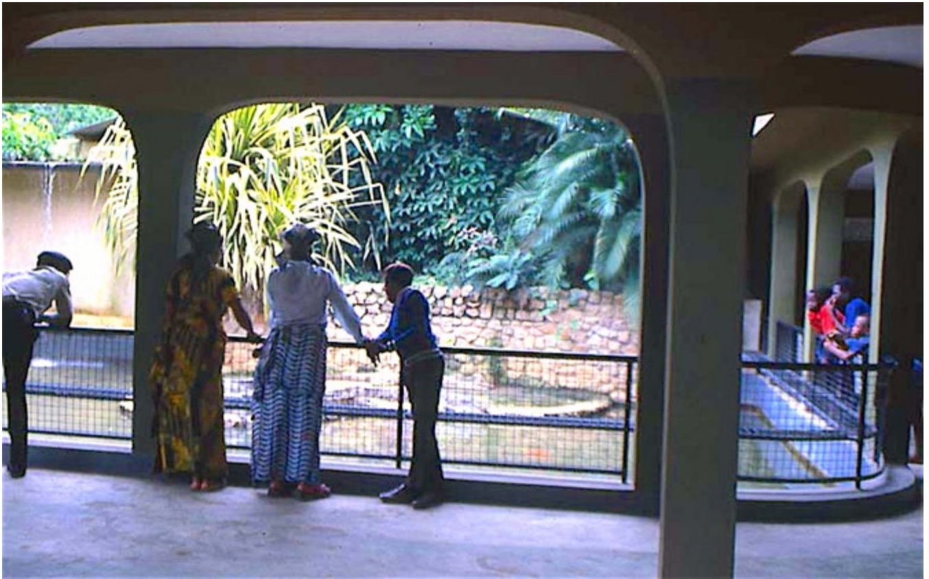
The outside crocodile enclosure and pool, part of the new Reptile House. Zoo visitors were protected from sun or rain while viewing from the walkway. To observe these reptiles so closely and in safety was a new experience for most visitors to the Zoo.

gradually emerge and was able to provide guidance or clarification when this or that option or uncertainty arose during construction. It was a relief as well as a challenge to take over the building on completion and to begin the job of equipping and developing it as a working Reptile House, complete with designated reptile staff, excellent animal accommodation and the animals that were to live there. The new Reptile House was a big step forward and, with its darkened viewing corridor providing excellent and secure sight of the creatures on display, offered visitors a new and very different experience. It contributed significantly to many more visitors coming into the Zoo and the University campus; during public holidays a queue of people now formed outside the Zoo entrance gate and extended along the road outside.