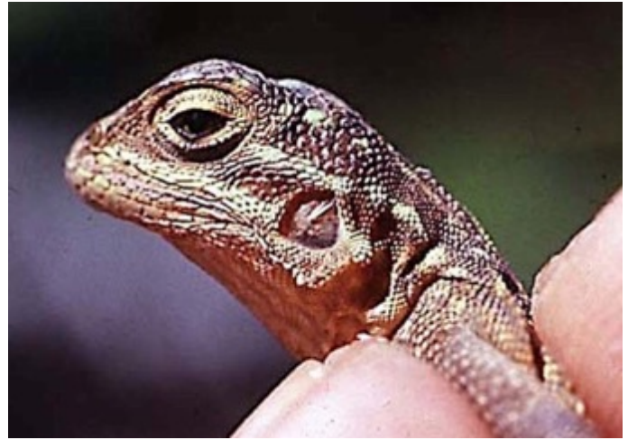
Young agama lizard.

near-orange. Females are smaller and are generally brownish or greyish in colour with yellow or pale markings. Agamas find much of their food while on the ground where they can often be seen darting around and occasionally grabbing and munching some small invertebrate.