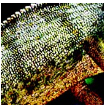
These photographs, of different graceful chameleons ( Chamaeleo gracilis ), give some idea of the range of skin colours and patterns that can be displayed by this species.