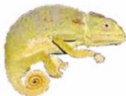
The two chameleons that started it all