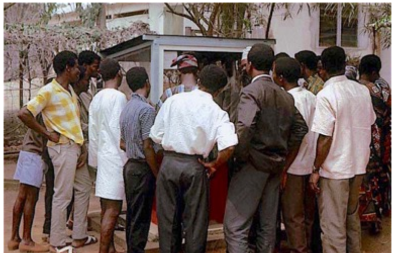
Zoo visitors watching chameleons feeding in the first trial chameleon exhibit; they were fascinated by the long tongues that could snatch a grasshopper in the blink of an eye!

I should explain that, when a chameleon sees a suitable insect or other invertebrate prey, it first attempts to move within tongue-shot range. The tongue is an extraordinary structure; when at rest it is located below and behind the mouth and can be up to 1.5 times the length of the reptile's body. When the chameleon is correctly positioned, and at exactly the right moment, both its eyes - having been moving independently and looking around in different directions - are suddenly directed at the prey so that the distance can be judged accurately. At the same time the chameleon opens its mouth and, sometimes slowly at first, protrudes its tongue. The chameleon, with both eyes still directed at its prey, takes careful aim. Suddenly and dramatically, the tongue is projected at very high speed toward the prey. One source states that the tongue reaches a speed of 60 miles per hour from zero in one hundredth of a second; and another that the chameleon's tongue hits its prey 'in less than a blink of a human eye' from the start of projection of the tongue! The prey animal is hit by the club-shaped end of the tongue which is sticky and which partially wraps around, and holds, the prey. The tongue,