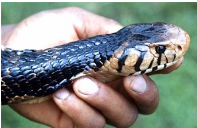
Black cobra ( Naja nigricollis ), 8ft 4in (2.54m) in length, killed on the University of Ibadan campus.

encountered fairly regularly as people went about their day to day business. Snakes, alive or sometimes dead, were brought regularly to the Zoological Garden by University staff or visitors from outside the campus who hoped we would buy them or who wanted us to identify them.